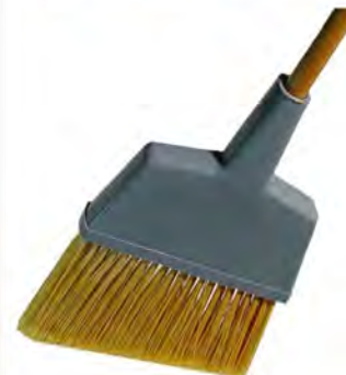
2519-BW SMALL ANGLE