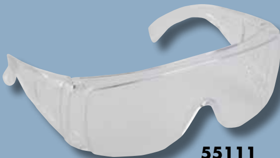
55111 Visitors, Clear Frame, Clear Lens, Fits Over Glasses, Vented Sides