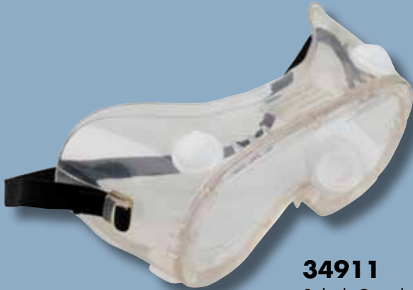
34911 Splash Goggles, Fits Over Glasses, Indirect Venting, Clear Lens