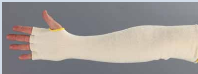
11708 24", 100% Cotton, Finger Holes