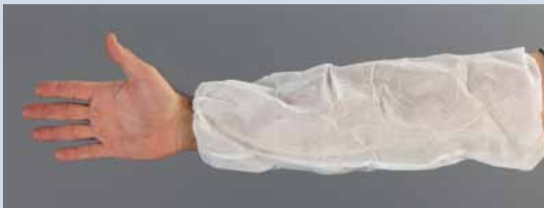
AGNWI 18" White Polypropylene, Elastic on Both Ends