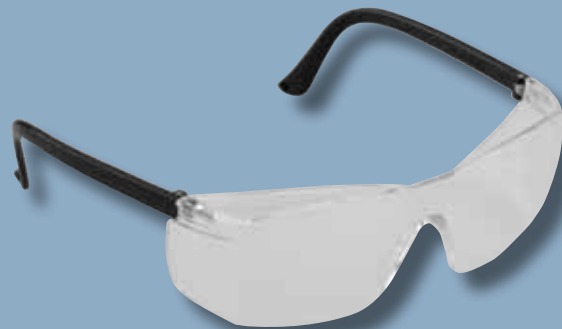
35110 Dragon, Frameless, Black Temples, Clear Lens