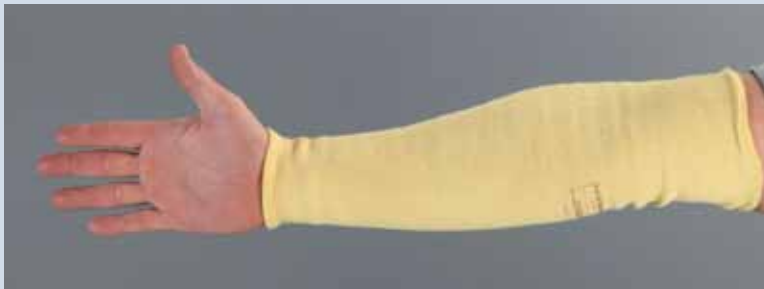
KDS18 18", Yellow, 100% Kevlar®