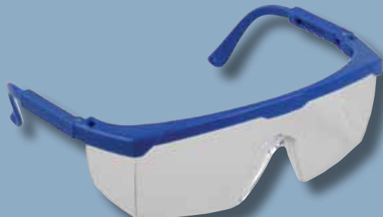
55113 Valiant, Blue Frame, Clear Lens