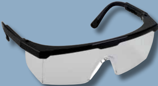
79602 Valiant, Black Frame, Clear Anti-Fog Lens