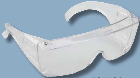
70553C Knight Squire, Oversized Clear PC Safety Spectacles