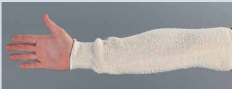
M1818 18", Terry Cloth, Loop-out